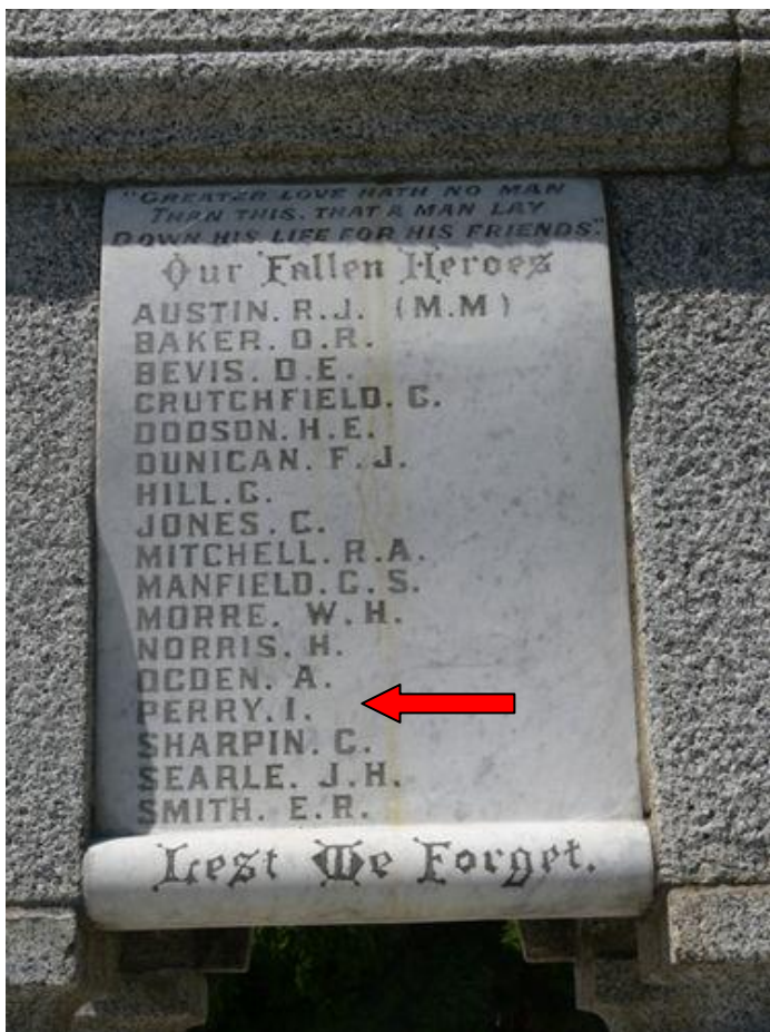
Benteleigh War Memorial